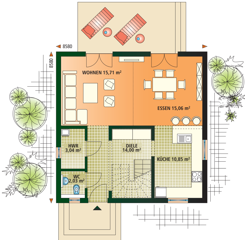
ERDGESCHOSS 60,69 m 2