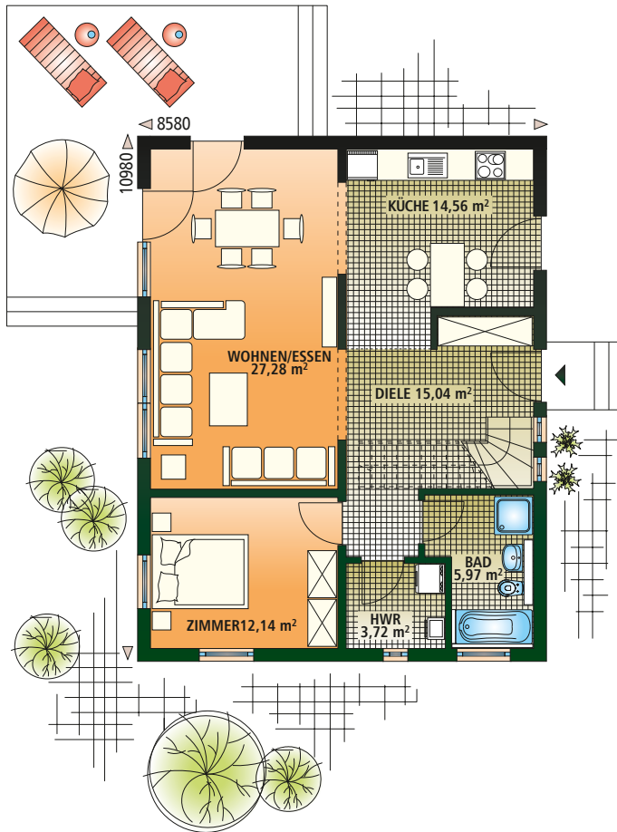
ERDGESCHOSS 78,71 m 2